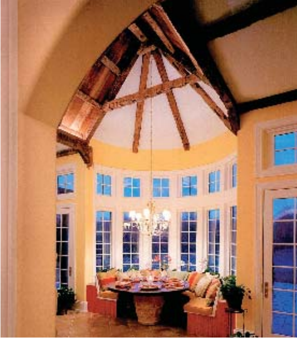
Some builders give clients a fixed price for the total project, and allowances for custom work.

amount. This pricing strategy allows the builder maximum pricing flexibility, i.e., increased profit potential, when asked to complete a change order or when the client's selections exceed the contractual allowances.