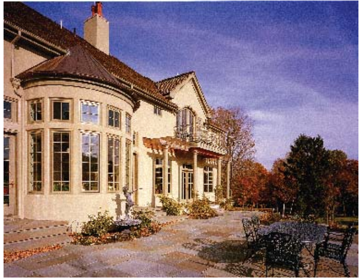
Rarely, if ever, is a custom or spec home completed as originally planned, making it difficult to create a win-win agreement for a fixed fee.

After reviewing all five door bids and meeting with four of the representatives, we selected the winning bidder and went through several shop drawings with their production draftsman. Each modification of the design, such as adding the beveled glass and specifying the depth of the cuts in the wood panels, impacted the supplier's price.